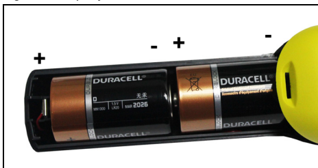
Figure 1 Properly installed alkaline batteries